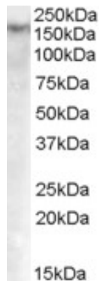
ARG64495 anti-DNMT1 antibody WB image

Western Blot: Jurkat cell lysate (35 µg protein in RIPA buffer) stained with ARG64495 anti-DNMT1 antibody at 0.5 µg/ml dilution.