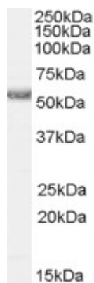
ARG64166 anti-Histamine Receptor H1 antibody WB image

Western blot: Human Heart lysate (35 µg protein in RIPA buffer) stained with ARG64166 anti-Histamine Receptor H1 antibody at 0.5 µg/ml dilution.