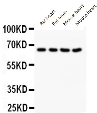
ARG59885 anti-NOX1 antibody WB image

Immunohistochemistry: Paraffin-embedded Rat kidney tissue stained with ARG59885 anti-NOX1 antibody.