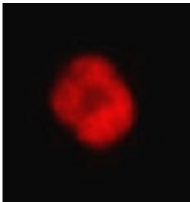
ARG54792 anti-Histone H4 dimethyl (Arg3) (symmetric) antibody ICC/IF image

Immunofluorescence: 293T cells stained with ARG54792 anti-Histone H4 dimethyl (Arg3) (symmetric) antibody.