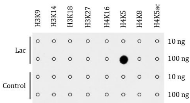
ARG43034 anti-Histone H4 lactyl (Lys5) antibody Dot blot image

Western blot: C6 cells were untreated (-) or treated (+) by Sodium lactate (100 mM) for 24 hours. 25 µg of cell lysates stained with ARG43034 anti-Histone H4 lactyl (Lys5) antibody at 1:500 dilution.