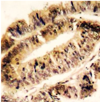
ARG41612 anti-AMPK alpha 1 phospho (Ser496) antibody IHC-P image

Immunofluorescence: Methanol-fixed HeLa cells stained with ARG41612 anti-AMPK alpha 1 phospho (Ser496) antibody.