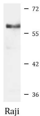
ARG41207 anti-NMT2 antibody WB image

Immunofluorescence: A549 cells stained with ARG41207 anti-NMT2 antibody.