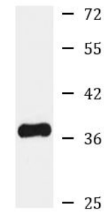
ARG41034 anti-PDXK antibody WB image

Immunofluorescence: U2OS cells stained with ARG41034 anti-PDXK antibody.