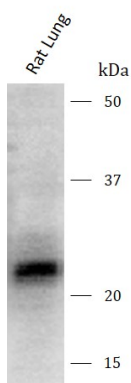
ARG24131 anti-Hsp 27 antibody [8A7] WB image

Immunohistochemistry: Human colon carcinoma stained with ARG24131 anti-Hsp 27 antibody [8A7] at 1:5000 dilution.