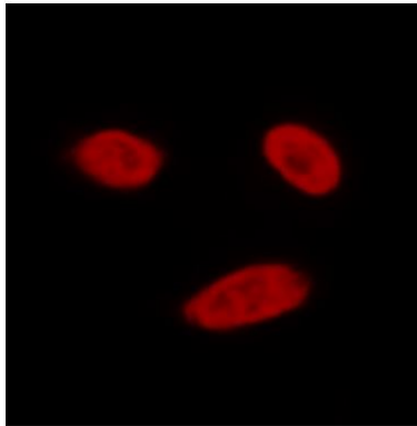
ARG24092 anti-MAPK7 / ERK5 antibody ICC/IF image

Immunofluorescence: K562 cells stained with ARG24092 anti-MAPK7 / ERK5 antibody.